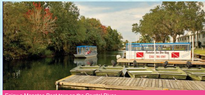
Enjoy a Manatee Boat tour on the Crystal River

Let's go on a trip to the natural wonder and beauty of West Central Florida. Our two days of travel takes us first to Clarksville, Tennessee, where a get acquainted dinner is held. Our second day of travel finds us in Macon, Georgia, in the heart of the South. (Dinner and breakfast)