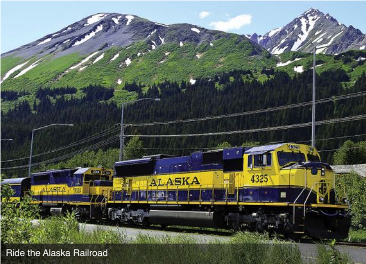
Ride the Alaska Railroad

After breakfast prepare for your group motorcoach transfer to the airport with a new appreciation of Alaska’s mountain spires, mighty rivers and glaciers. (Breakfast)