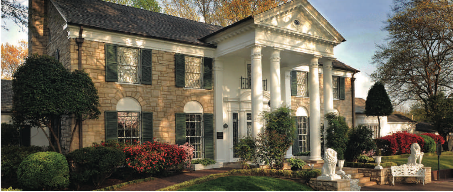
Visit Elvis's Graceland Mansion