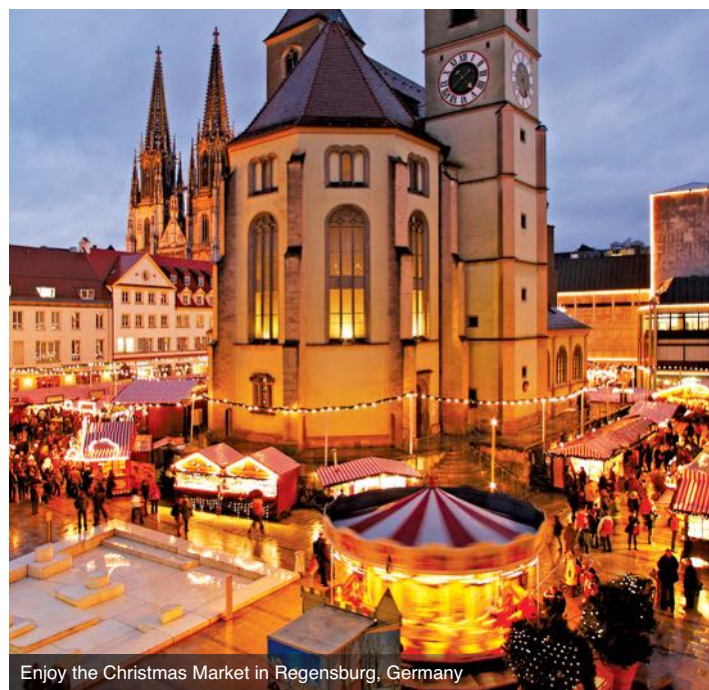
Enjoy the Christmas Market in Regensburg, Germany

Our day begins with a guided tour of Nuremberg. During the panoramic tour by coach we'll venture outside of the inner city to see the Palace Of Justice, site of the famous war trials, and one of the few buildings in Nuremberg that survived the extensive bombings of Germany. We'll also see St. John's Cemetery and the former Nazi Party Rally Grounds. Returning to the city center, we begin the walking portion of the tour. Our guide takes us through the Old Town and provides insights about the castle, fountains, churches and art as well as the city's past and present. After the tour, we'll have free time for visiting the Christkindle Market. This afternoon, the ship departs for Regensburg, Germany. (Breakfast, lunch, dinner and evening snack onboard)