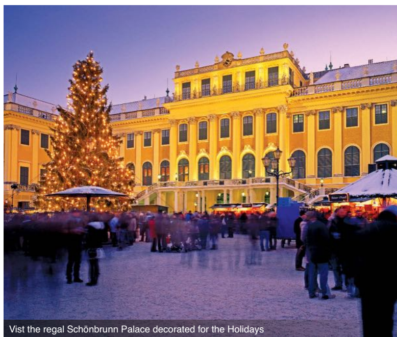
Visit the regal Schönbrunn Palace decorated for the Holidays