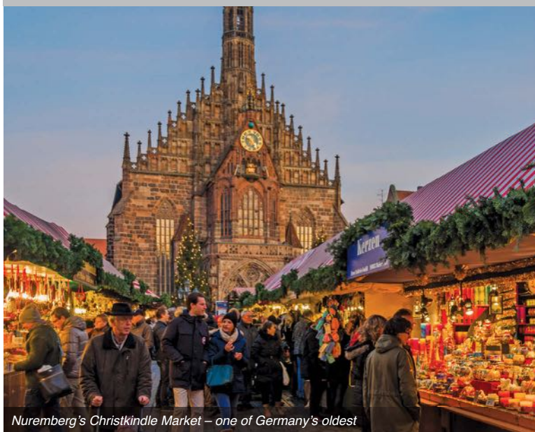
Nuremberg's Christkindle Market – one of Germany's oldest