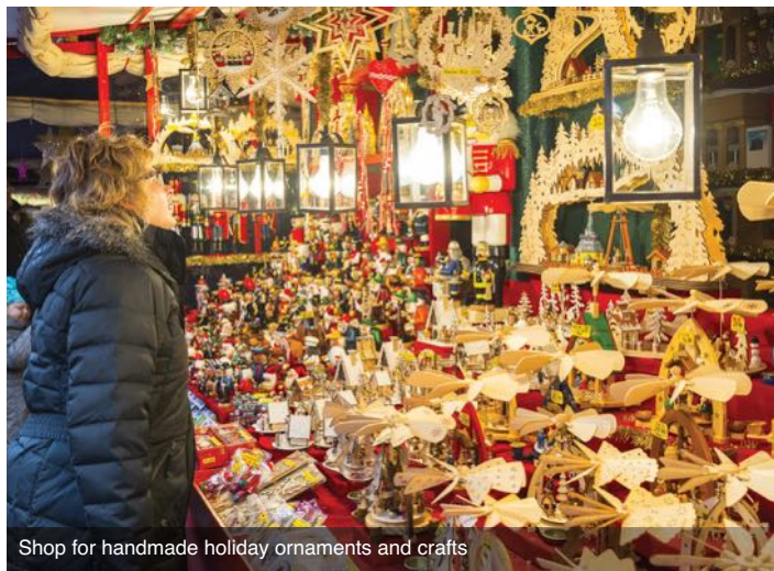
Shop for handmade holiday ornaments and crafts