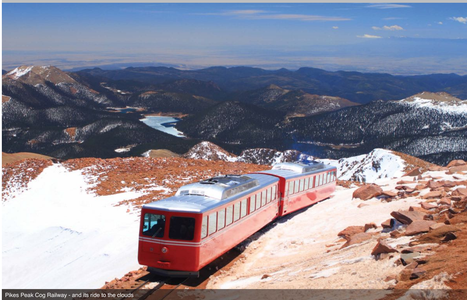
Pikes Peak Cog Railway - and its ride to the clouds