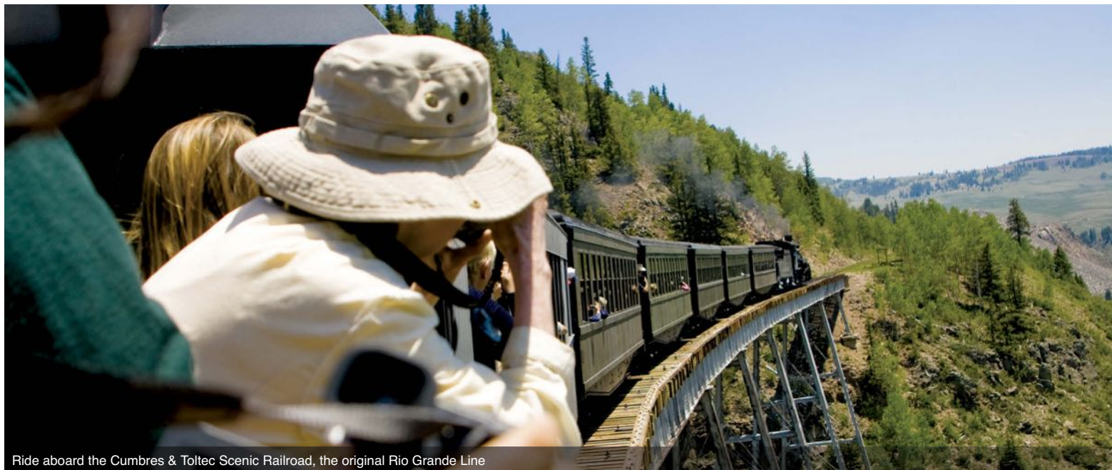
Ride aboard the Cumbres & Toltec Scenic Railroad, the original Rio Grande Line