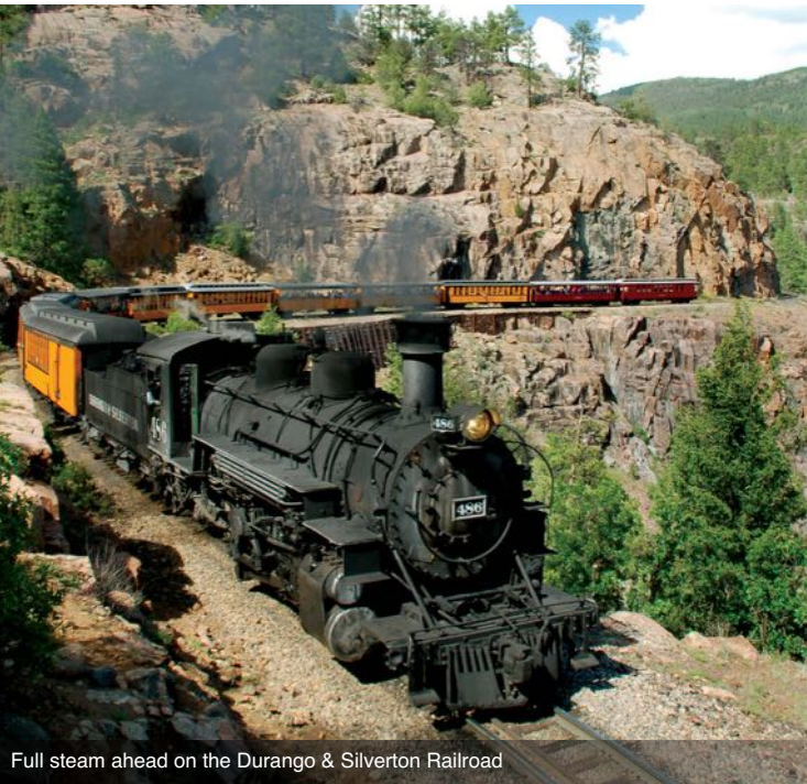
Full steam ahead on the Durango & Silverton Railroad