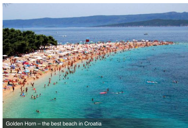
Golden Horn – the best beach in Croatia

Itinerary is subject to change based on operating conditions.