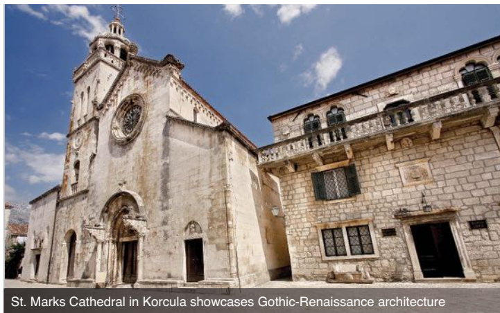
St. Marks Cathedral in Korcula showcases Gothic-Renaissance architecture