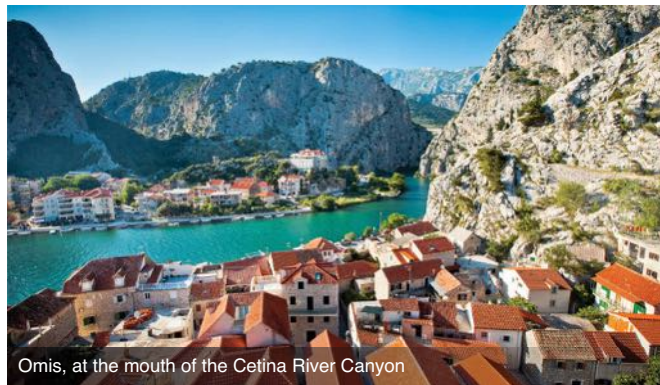
Omisi, at the mouth of the Cetina River Canyon