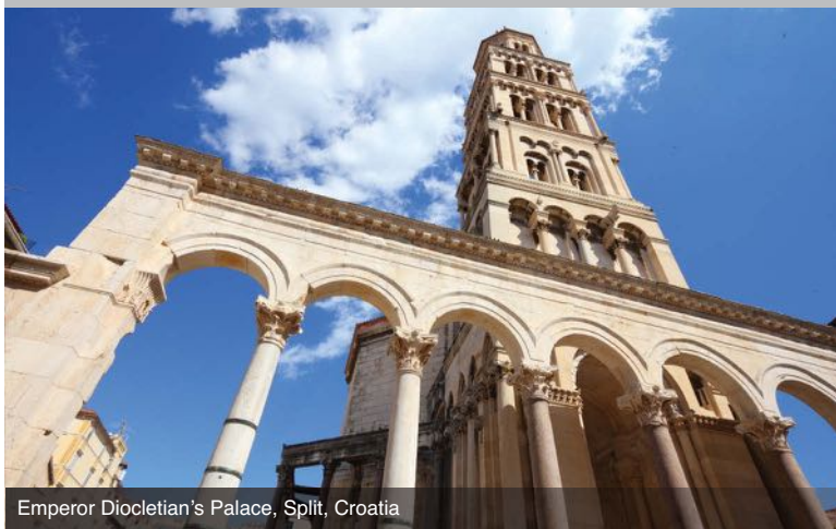
Emperor Diocletian's Palace, Split, Croatia