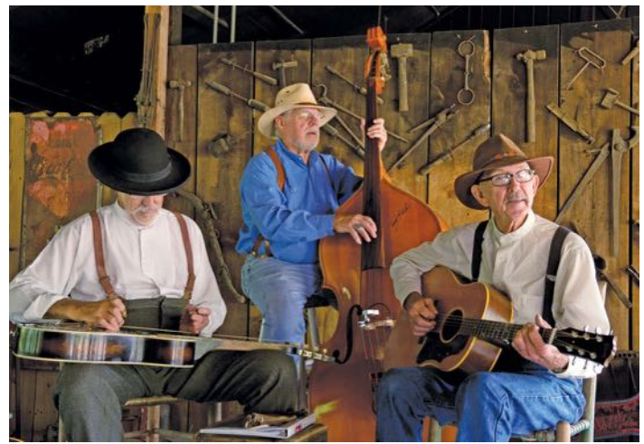
Enjoy live musical entertainment at the Ozark Folk Center State Park

FOR RESERVATIONS OR INFORMATION CONTACT: