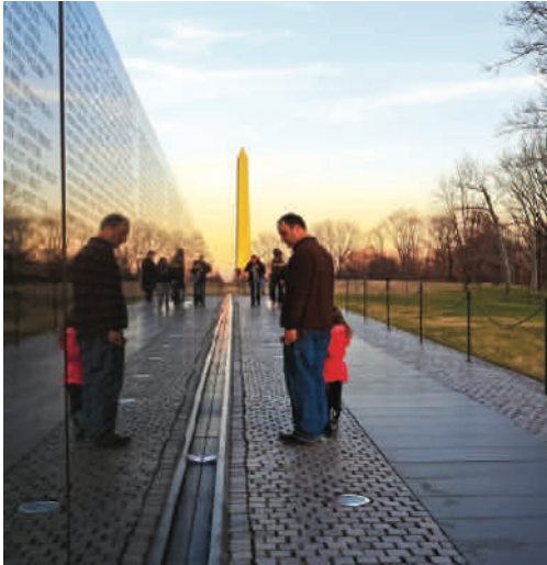
Explore the monuments and memorials in Washington, DC