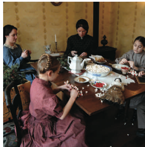
Visit the Shriver House in Gettysburg