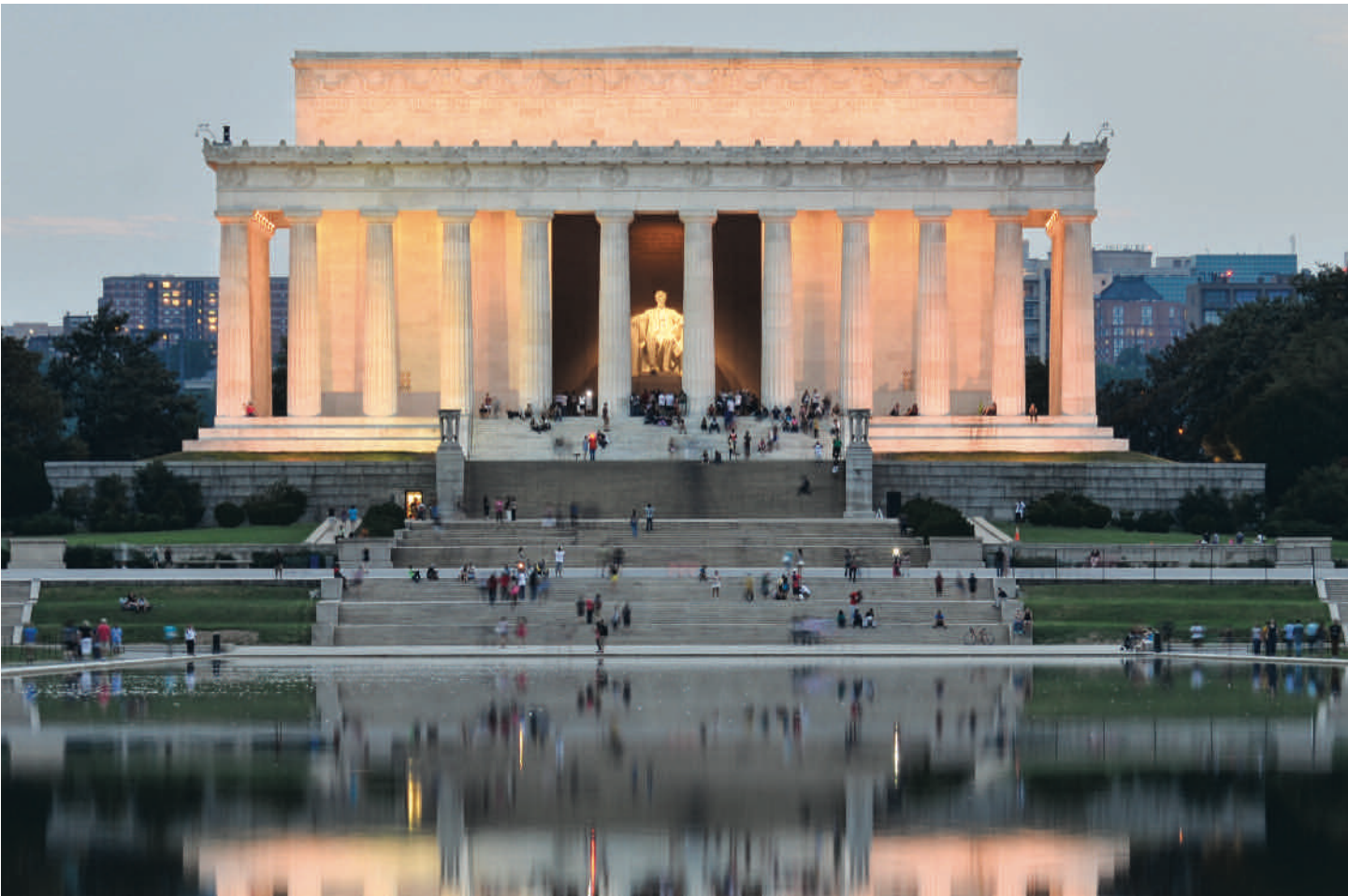
Tour the Washington, DC National Mall Area with a licensed guide