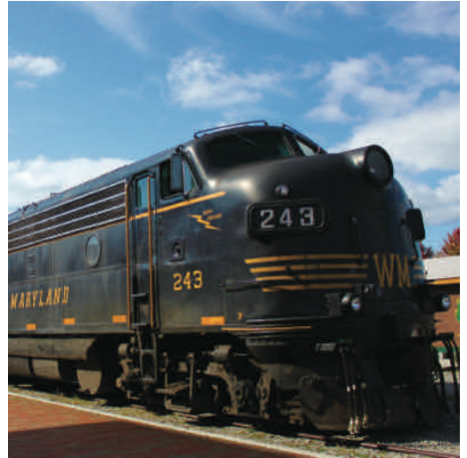
Ride the rails aboard the New Tygart Flyer

By 1830, the track had reached 13 miles and eventually stretched over 4,000 miles linking 13 states with the nation's capital. Tonight, prepare for an exceptional buffet-style dinner and dynamic entertainment experience at Toby's Dinner Theatre. This award-winning theater troop offers Broadway and original musicals featuring a live orchestra with a unique theater-in-the-round performance. (Breakfast and dinner)