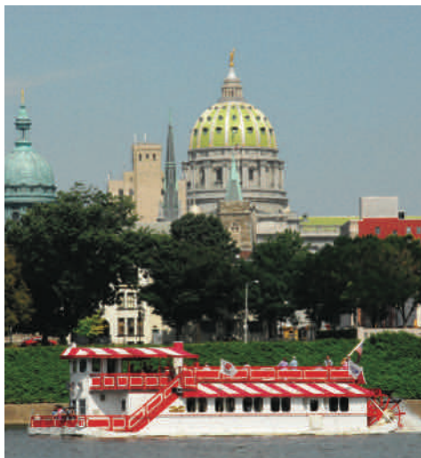
Cruise aboard the Pride of Susquehanna riverboat