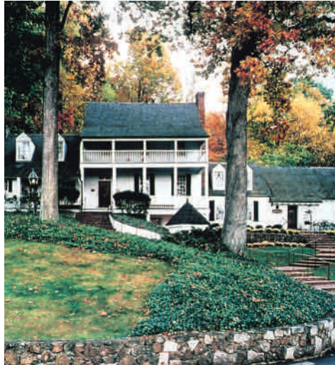
Enjoy dinner at historic Mitchie Tavern