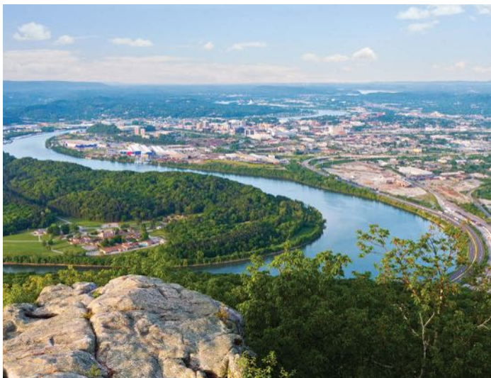
Visit the amazing Rock City in Chattanooga, Tennessee

Nestled in the Blue Ridge Mountains is the Alpine village of Helen, Georgia, known for its annual fall Oktoberfest celebration, the largest of its kind in the southeast. However, we are here to experience the once-in-a-lifetime experience, the total solar eclipse. After checking into our hotel, we experience an authentic Bavarian dinner which reflects the region's strong German influence.