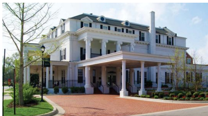
Enjoy dinner and overnight at historic Boone Tavern in Berea, Kentucky

After breakfast we return home with memories of the Georgia's Appalachia region and this once-in-a-lifetime event. (Breakfast)