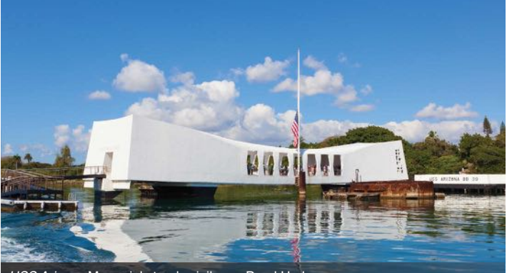
USS Arizona Memorial stands vigil over Pearl Harbor

Today is yours to explore Honolulu at your leisure. Visit more historic sites or find a cozy spot to relax on Waikiki Beach.