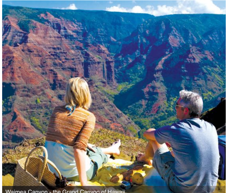
Waimea Canyon - the Grand Canyon of Hawa

After a morning free, your Tour Manager will arrange a transfer to the airport. Fly through the night and return home early in the morning with memories of Hawaii's superb culture and beauty. (Breakfast))