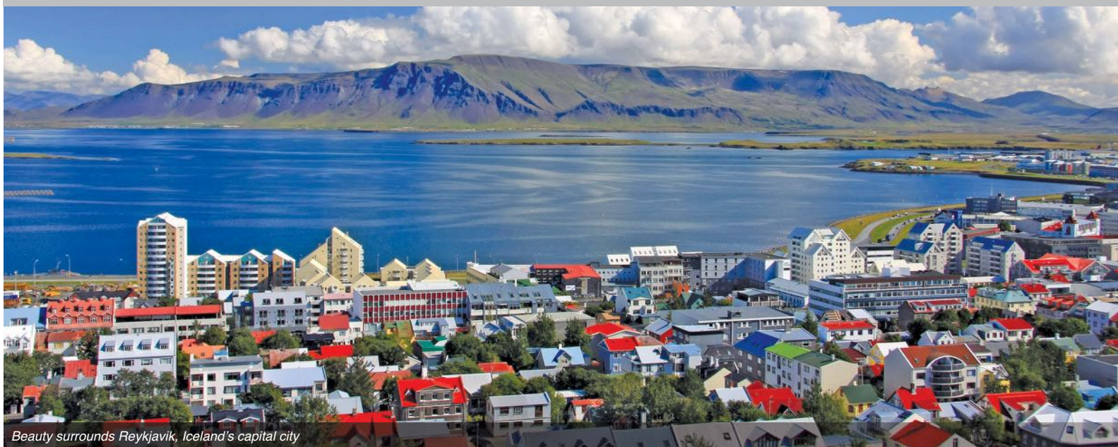
Beauty surrounds Reykjavik, Iceland's capital city