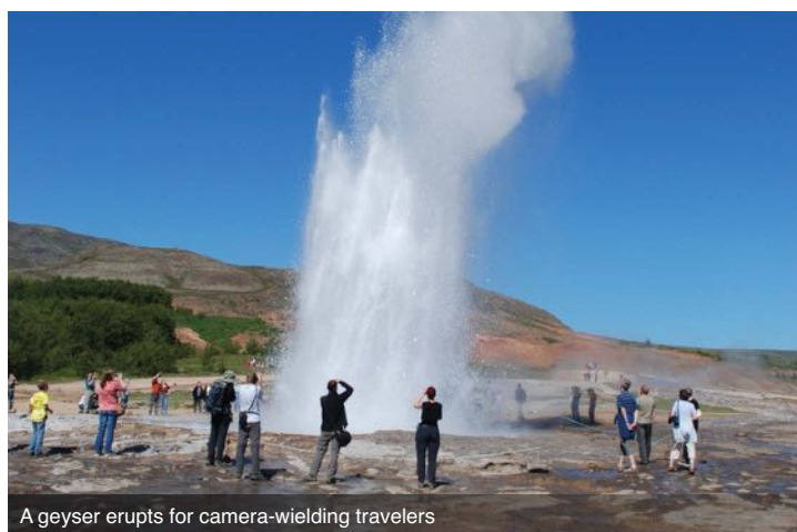
A geyser erupts for camera-wielding travelers

Itinerary subject to change based on local conditions.