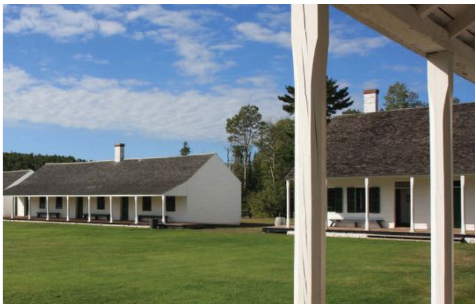
Visit the Fort Wilkins Historic Complex