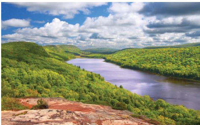
Stop at the Lake of the Clouds overlook in Porcupine Mountains State Park

We follow the rugged shoreline of the Keweenaw Peninsula to the town of Copper Harbor. This was once the center of the copper mining in the region and was also a supply depot and gathering point for exploring parties. At the end of the Keweenaw Peninsula stands the Fort Wilkins Historic Complex, a well-reserved nineteenth-century military post and lighthouse complex. Later we come to Porcupine Mountains State Park for a stop at the Lake of the Clouds overlook. Located between two mountain ridges, the