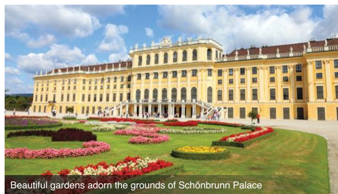
Beautiful gardens adorn the grounds of Schönbrunn Palace

Discover all Vienna has to offer with an included orientation tour. For over 600 years, the magnificent baroque capital city of Vienna was the seat of the mighty Hapsburg Emperors, a her-