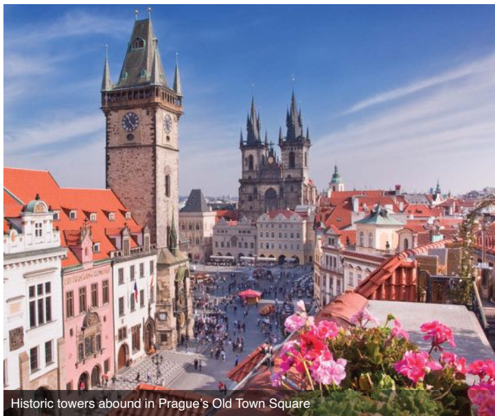
Historic towers abound in Prague's Old Town Square

itage that has bestowed it with many dazzling palaces and monuments: the lavish Hofburg Palace, the impressive Vienna Opera House and the majestic Ringstrasse. The capital is also known as the “City of Music” for having once been the home of composers such as Beethoven, Schubert, Mozart and Johann Strauss. On your included excursion, see some of the famous sights of this impressive city and visit Schönbrunn Palace, with its magnificent interiors and landscape gardens. Enjoy leisure time in the city center in the afternoon. This evening, join an optional excursion for a musical concert in one of the famous music venues of the city. (Breakfast, lunch, dinner and evening snack onboard)