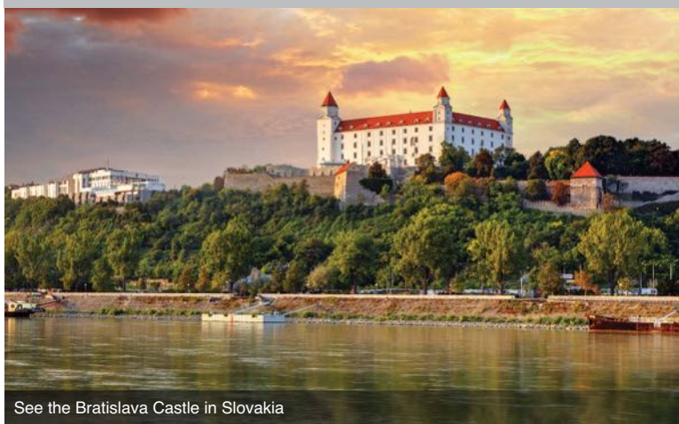
See the Bratislava Castle in Slovakia