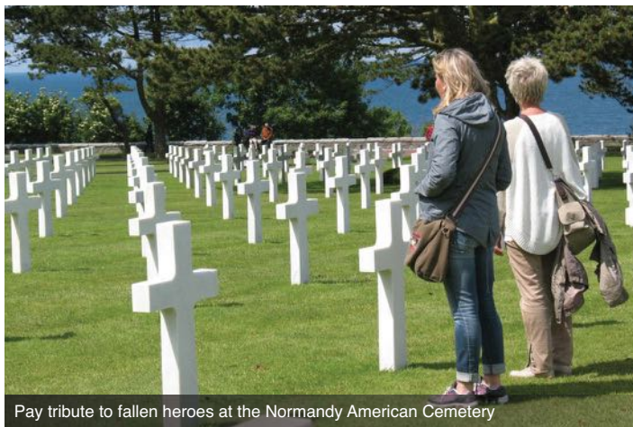
Pay tribute to fallen heroes at the Normandy American Cemetery

After breakfast, it's time for our river cruise to come to an end as we disembark the ship in Nantes. However there is much more to come as we discover the Normandy region of France. Transfer by coach to the now peaceful province of Normandy which is so very different today than on June 6, 1944. Visit Ponte du Hoc, situated on the coast near Grandcamp-Maisy, with sweeping views of the English Channel from atop the cliffs. Drive to Omaha Beach and visit the Normandy American Cemetery and Memorial in Colleville-sur-Mer where thousands of white crosses mark the graves of our military heroes. The excursion ends at our hotel in Caen. (Breakfast)