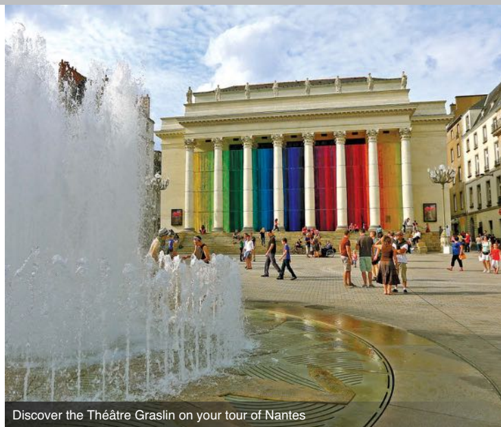
Discover the Théâtre Graslin on your tour of Nantes

Before setting sail, disembark the ship for an excursion of Nantes, known as the city of the Dukes of Brittany. Discover the