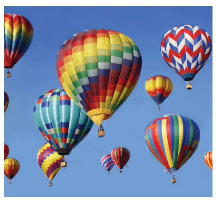
Hot air balloons color the sky above Albuquerque and its Balloon Fiesta