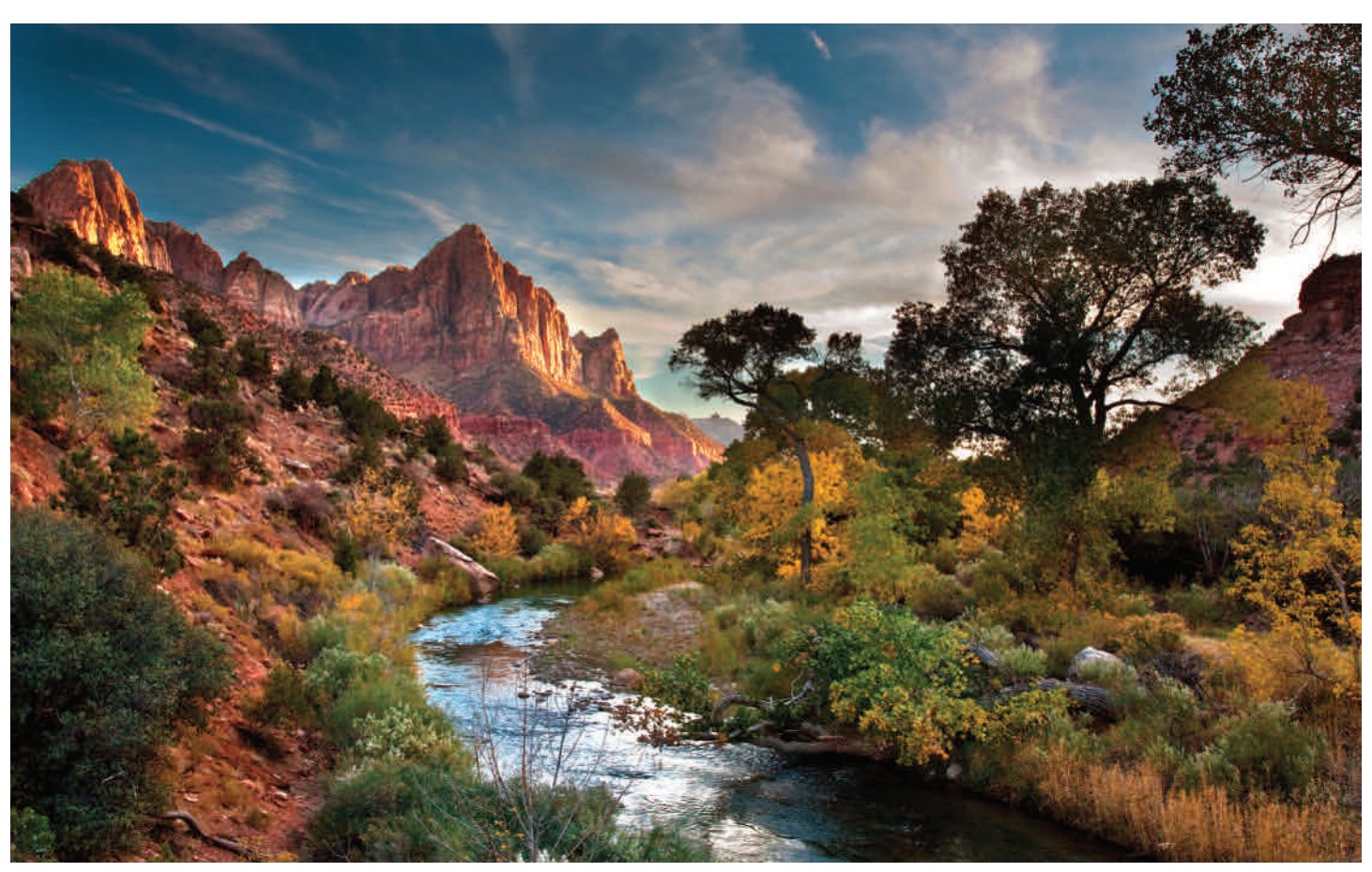
Zion National Park