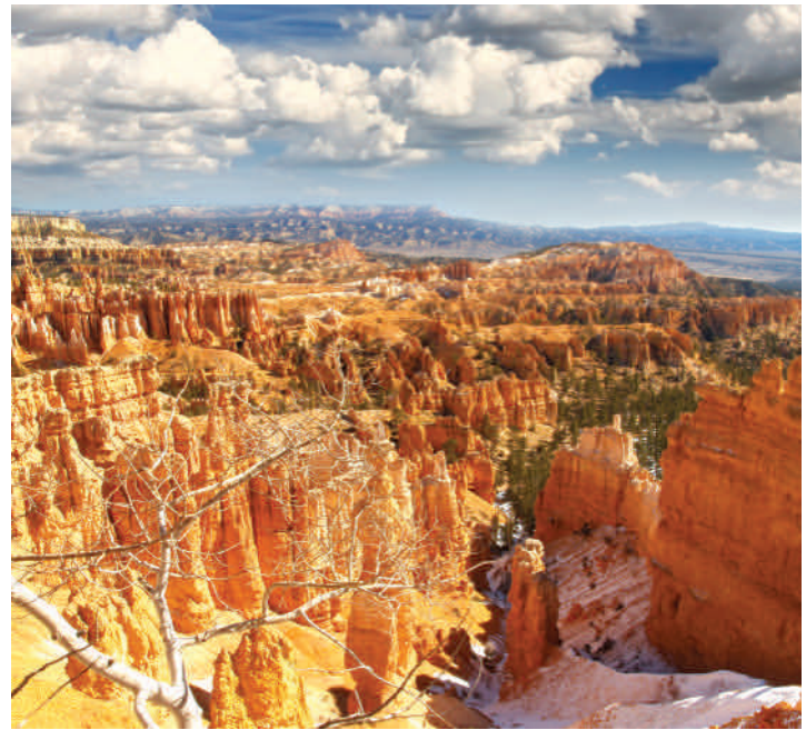
Bryce Canyon National Park