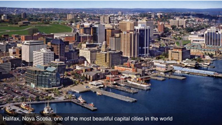
Halifax, Nova Scotia, one of the most beautiful capital cities in the world

The Norwegian Gem sails into New York harbor where a group transfer to New York's LaGuardia Airport has been arranged for flights departing after 2:00 p.m. (Breakfast onboard)