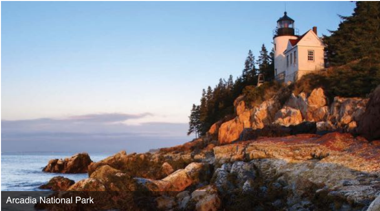
Acadia National Park