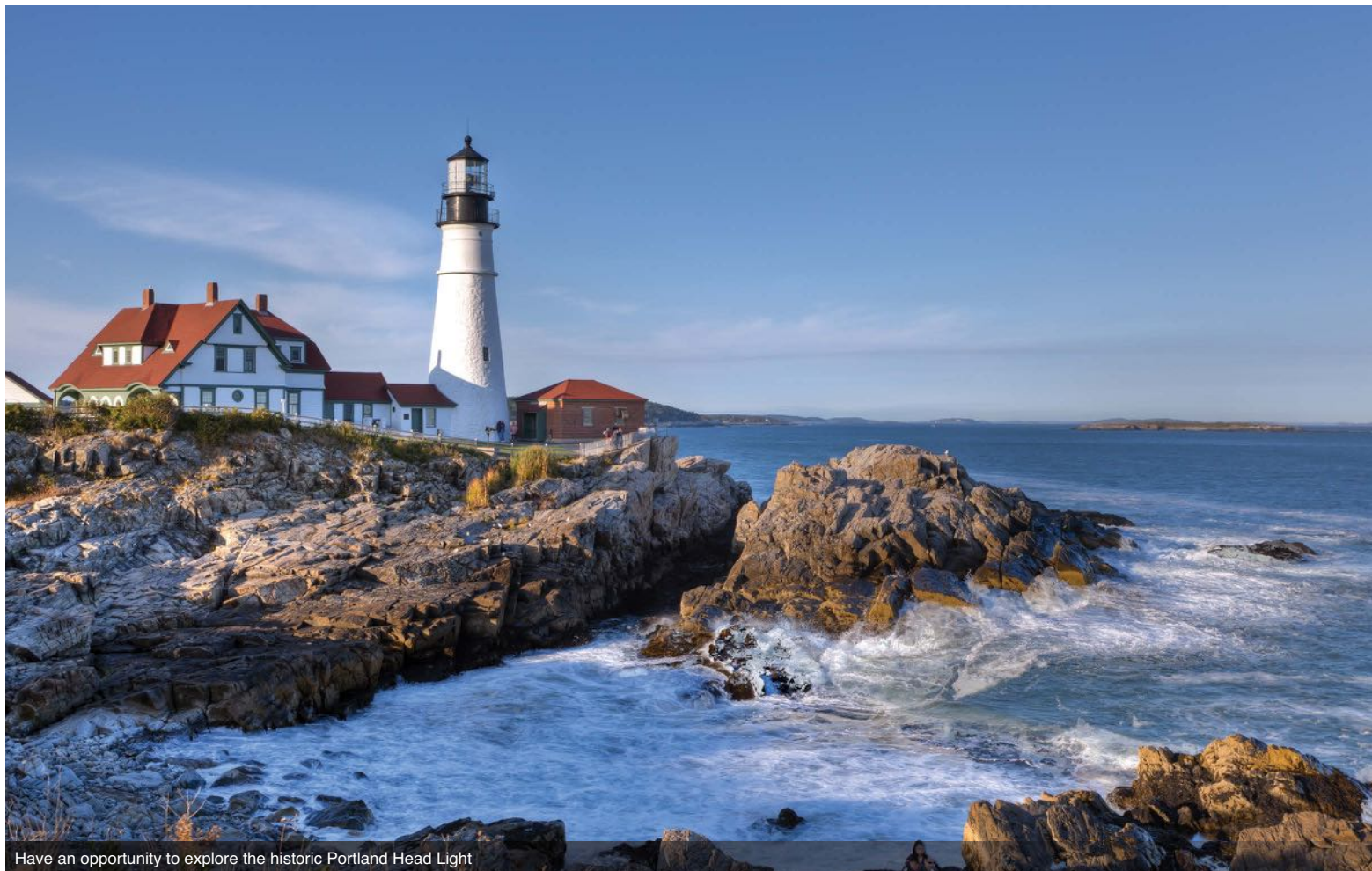
Have an opportunity to explore the historic Portland Head Light