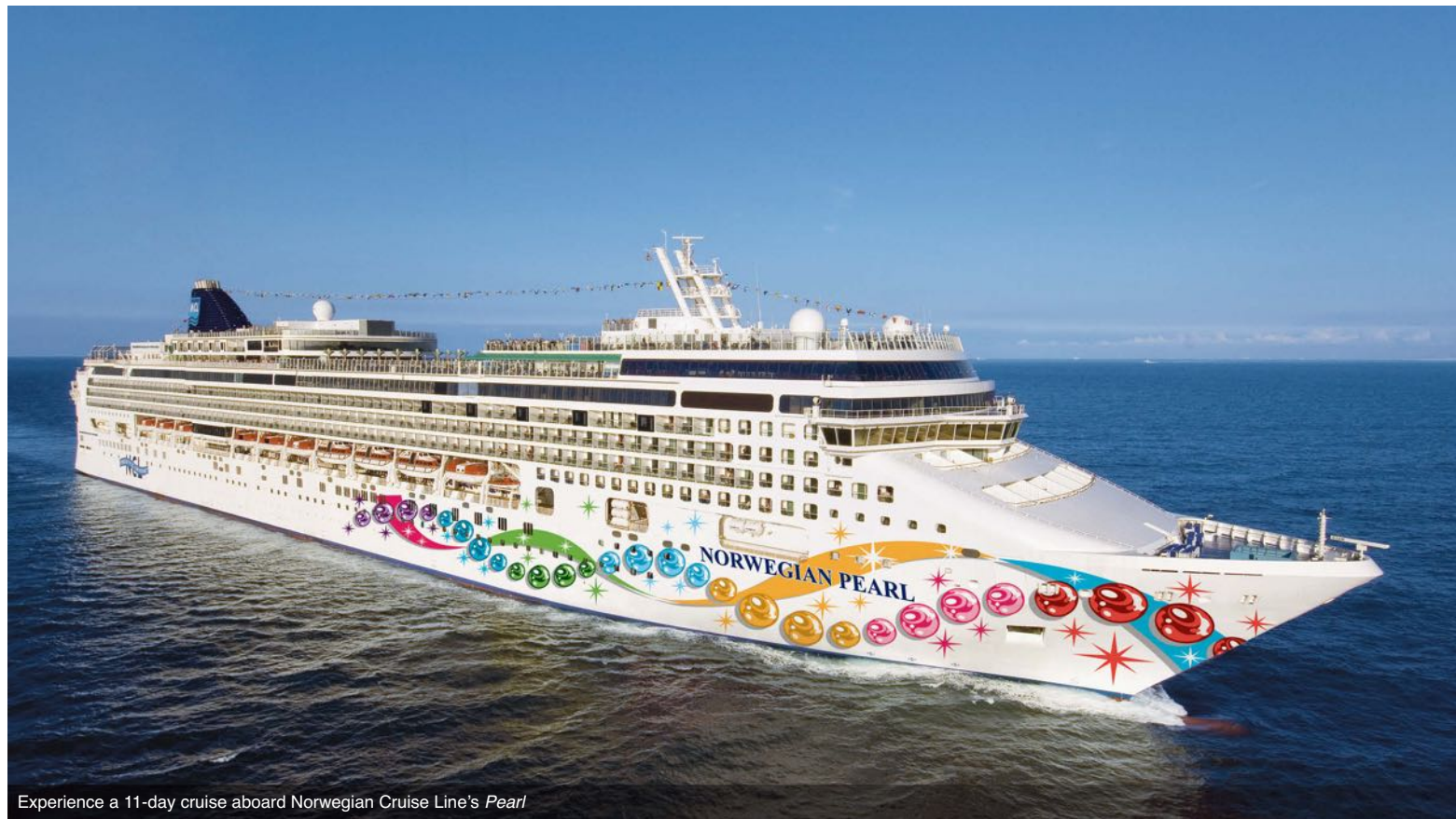
Experience a 11-day cruise aboard Norwegian Cruise Line's Pearl