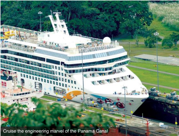
Cruise the engineering marvel of the Panama Canal

Arrive in Miami and take the group transfer to the Miami International Airport for flights out after 1:00 p.m. (Breakfast)