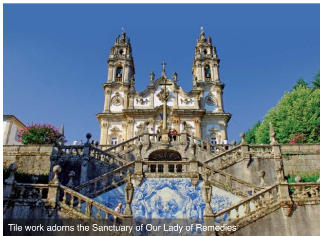
Tile work adorns the Sanctuary of Our Lady of Remedies

Enjoy the morning onboard leisurely sailing along the Douro through landscapes of terraced vineyards and small towns. An afternoon excursion to the countryside visits the wine chateau Quinta do Seixo. Learn about the wine-making process of Port wine before sampling the vintage from the tasting room offering spectacular views of the river valley and vineyards below. This is sure to be a life-enriching experience! Touring continues in