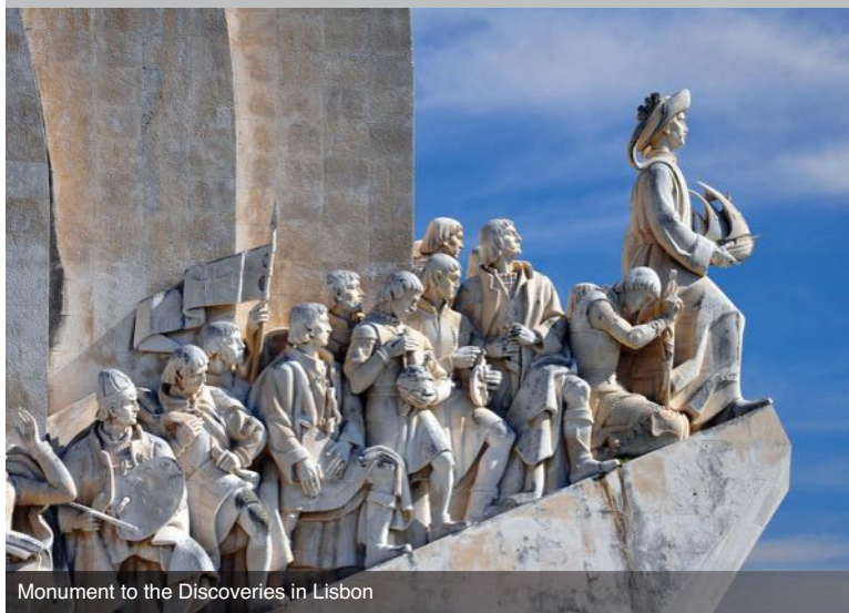
Monument to the Discoveries in Lisbon