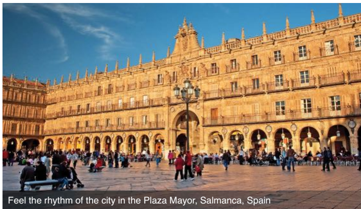
Feel the rhythm of the city in the Plaza Mayor, Salamanca, Spain

fore arriving at the stone archway entrance to the walled village. An inside visit to the well-preserved Church of Our Lady of Rocamador showcases relics of the period. See the ruins of the castle and clock tower as well as the former prison house, medieval well and pillory as you stroll through the cobblestone lanes. (Breakfast, lunch and dinner onboard)