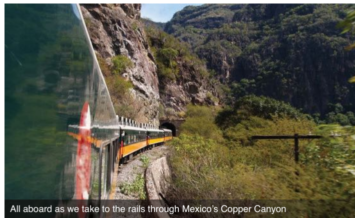
All aboard as we take to the rails through Mexico's Copper Canyon

Departing Chihuahua, we'll drive past the old Bocoyna mission, which was built by the Jesuits in 1692 before continuing on to the Canyon. We make a stop at Divisadero, "the lookout point" for unparalleled views of the three canyons which make up the Copper Canyon. Four times larger than the Grand Canyon, this region offers spectacular vistas of pristine mountain wilderness. In the afternoon, we take a trip to "Parque Aventura Barrancas del Cobre" where we climb aboard an aerial tram with spectacular views of the canyon. For those