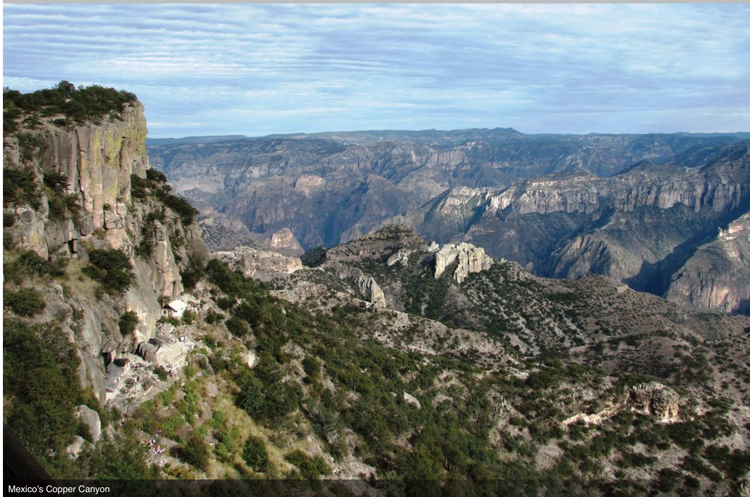
Mexico's Copper Canyon