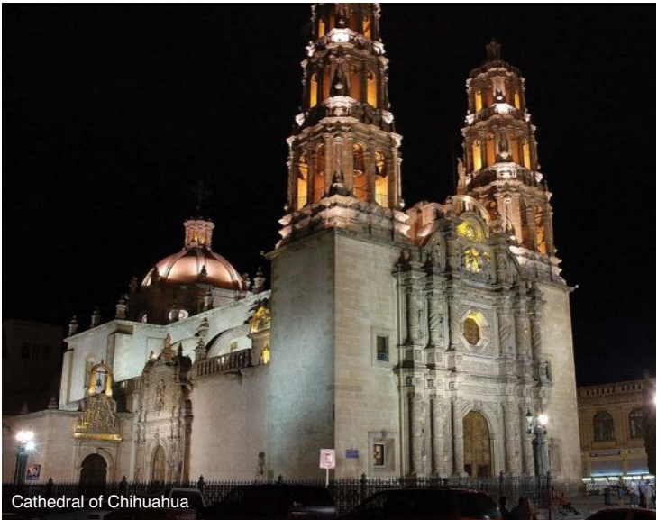
Cathedral of Chihuahua

After breakfast, our group transfer takes us to the El Paso airport for flights out after 2:00 p.m. (Breakfast)