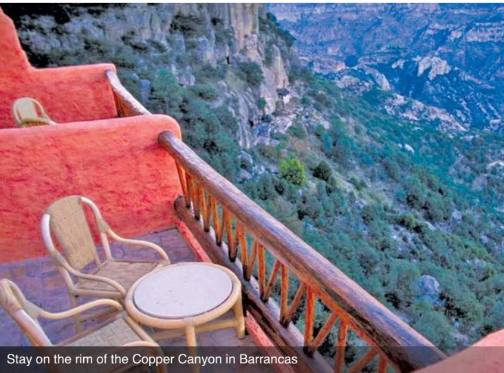
Stay on the rim of the Copper Canyon in Barrancas

who wish an optional zip lining adventure is available for purchase. Later, we arrive at our canyon-side hotel which features terraces and offers views overlooking the Copper Canyon. Tonight, dinner is at the hotel.