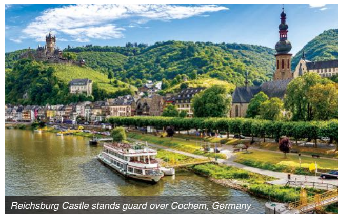
Reichsburg Castle stands guard over Cochem, Germany

This morning after breakfast you arrive in Cochem where along the beautiful Mosel River, countless vineyards with varying shades of green and squares of grapevines unfold before your eyes. Cochem, rated one of the prettiest villages along the Mosel, is best known for its fortified gates, pastel-colored or half-timbered buildings, Baroque towers and vintages of Mosel Riesling wine. Enjoy an included guided tour of the 19th-century Reichsburg Castle with its many spires and mighty brick walls that provide contrast to the surrounding lush vegetation.