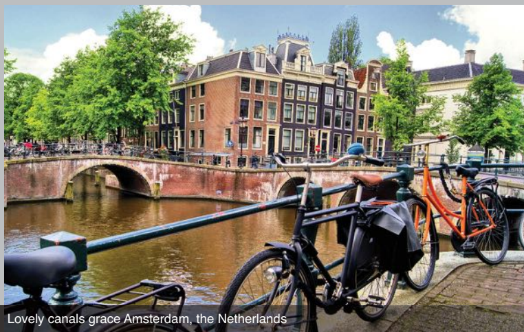
Lovely canals grace Amsterdam, the Netherlands