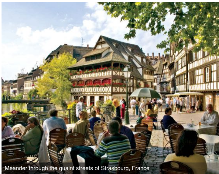
Meander through the quaint streets of Strasbourg, France

With a late afternoon departure, the ship sails on to the charming town of Boppard. Following dinner, enjoy a special performance in the lounge by local German entertainers.