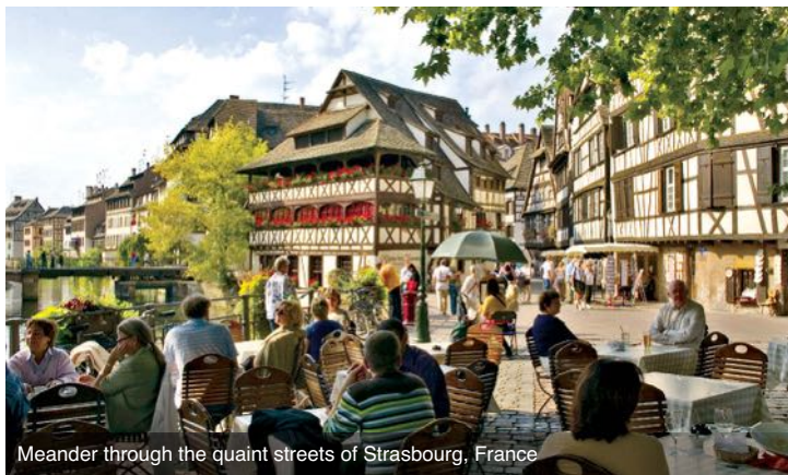
Meander through the quaint streets of Strasbourg, France

turey Reichsburg Castle with its many spires and mighty brick walls that provide contrast to the surrounding lush vegetation. With a late afternoon departure, the ship sails on to the charming town of Boppard. Following dinner, enjoy a special performance in the lounge by local German entertainers.