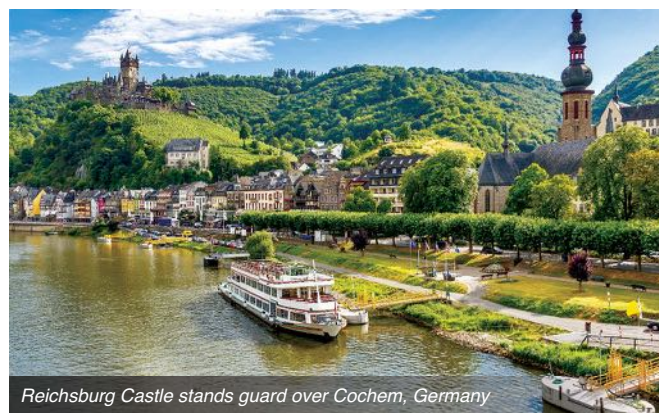
Reichsburg Castle stands guard over Cochem, Germany

This morning after breakfast you arrive in Cochem where along the beautiful Mosel River, countless vineyards with varying shades of green and squares of grapevines unfold before your eyes. Cochem, rated one of the prettiest villages along the Mosel, is best known for its fortified gates, pastel-colored or half-timbered buildings, Baroque towers and vintages of Mosel Riesling wine. Enjoy an included guided tour of the 19th-cen-