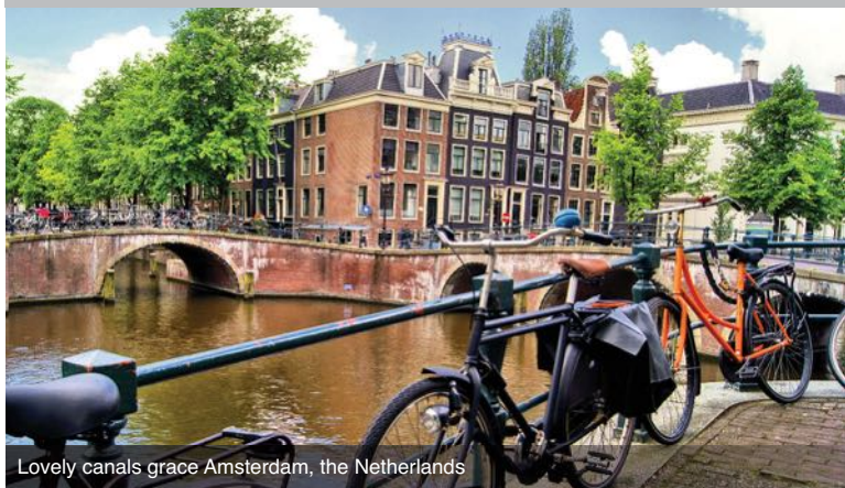
Lovely canals grace Amsterdam, the Netherlands