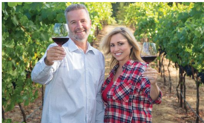
Enjoy wine tasting along the Niagara Peninsula

Skirting Lake Ontario we travel through the winery-rich Niagara Peninsula. Here, we stop at the region's original winery, Inniskillin for a private tour and tasting. Then, we continue to another of the peninsula's great wineries Jackson-Triggs. Here we are treated to a casual family-style lunch served with a carefully paired glass of wine followed by an estate tour. Then, we continue to Niagara Falls, our home for the next two nights. (Breakfast and lunch)