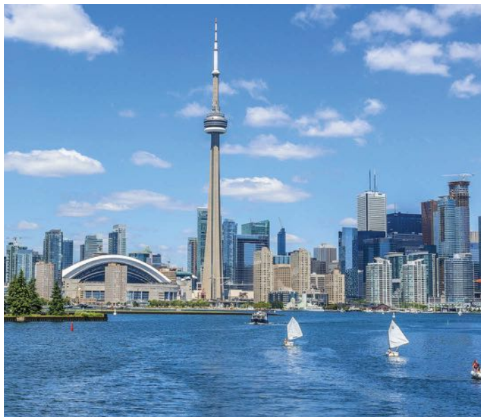
Enjoy a narrated tour of Toronto including the CN Tower

landmark features unique architecture and stained glass. Then you'll soar to new heights as you are whisked away to the top of the famous CN Tower for a dramatic panoramic view of Toronto and included dinner. (Breakfast and dinner)