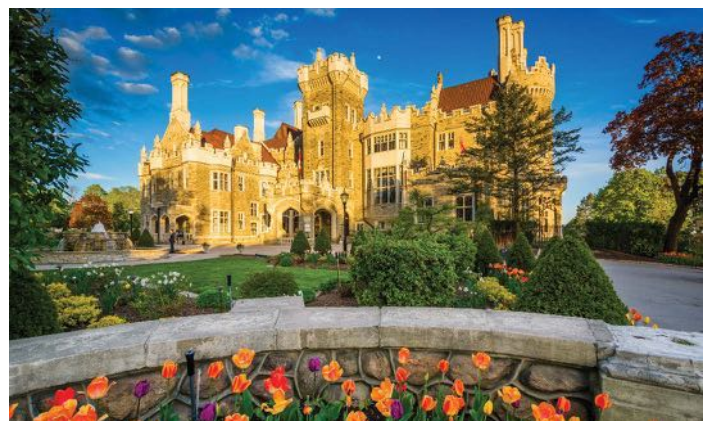
Take a guide tour of Casa Loma Castle

In Toronto, a local guide joins us for a tour of this cosmopolitan Canadian city. See the unique City Hall building, Parliament Hill and the Chinatown district. Then, we have a guided tour of Casa Loma Castle, the home of Sir Henry Pellat. This renowned Toronto