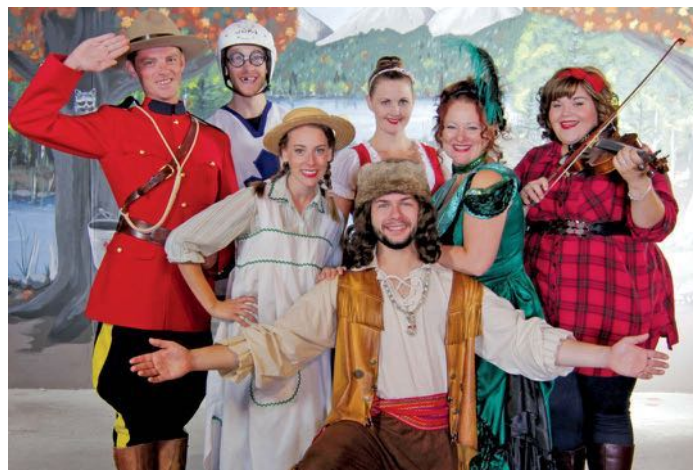
Enjoy the hilarious Oh Canada, Eh? Dinner Show

After breakfast we travel home from our neighbor to the north, Canada. (Breakfast)