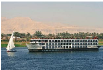
Spend four nights aboard the luxurious MS Mayfair