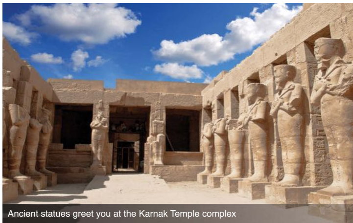
Ancient statues greet you at the Karnak Temple complex

plex which comprises a vast mix of decayed temples, chapels, pylons, and other buildings. This complex, a city of temples built over 2,000 years ago, is the largest religious building ever constructed. Luxor Temple is a large Ancient Egyptian temple complex in the city today known as Luxor which was founded in 1400 BC. Luxor is unique among the main Egyptian temple complexes in having only two Pharaohs leave their mark on its architectural structure. (Breakfast) (Lunch and dinner onboard)