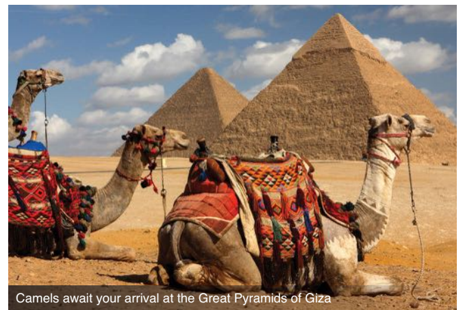
Camels await your arrival at the Great Pyramids of Giza

Depart for the Cairo airport for an early morning flight to Luxor. Upon arrival, you will be transferred to your river ship, MS Mayfair , for a four night cruise on the Nile River. Following lunch onboard, you'll visit the Karnak Temple Com-