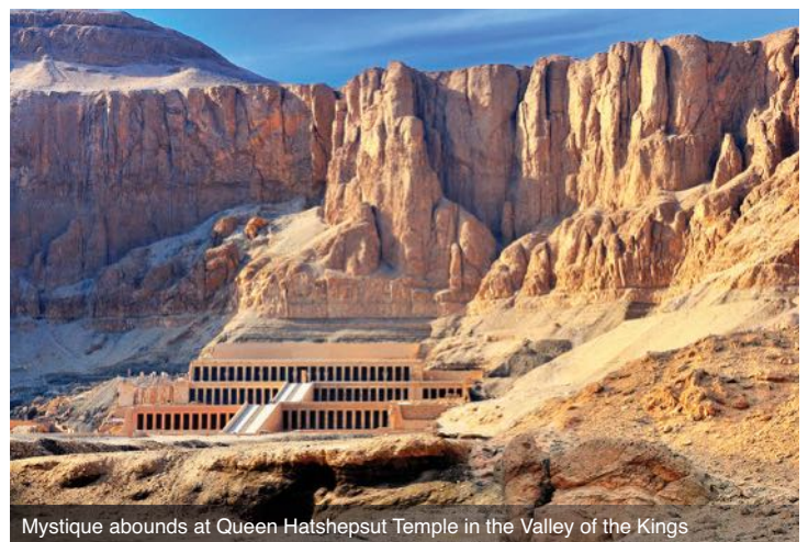
Mystique abounds at Queen Hatshepsut Temple in the Valley of the Kings