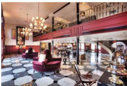
Ship's lobby provides an inviting welcome