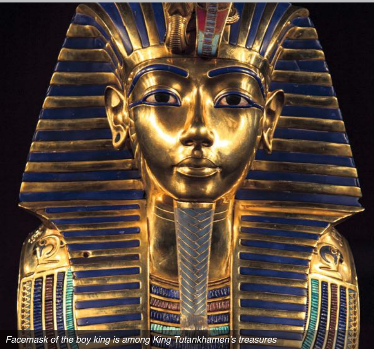
Facemask of the boy king is among King Tutankhamen's treasures