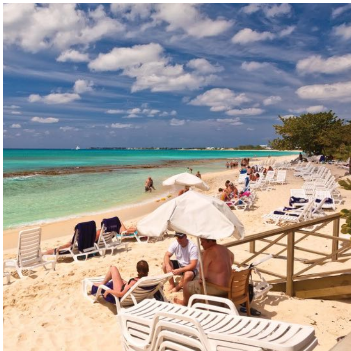
Relax on the pristine beaches of Grand Cayman

room service, a full casino, including table games and slots, three pools and dozens of fun activities. (All meals onboard)