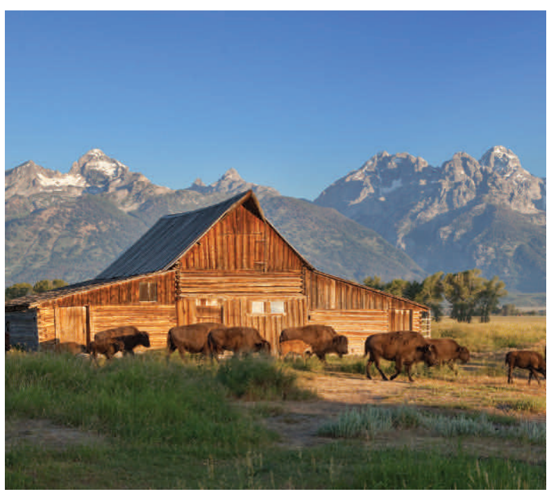
Bison roaming through picturesque Grand Teton National Park