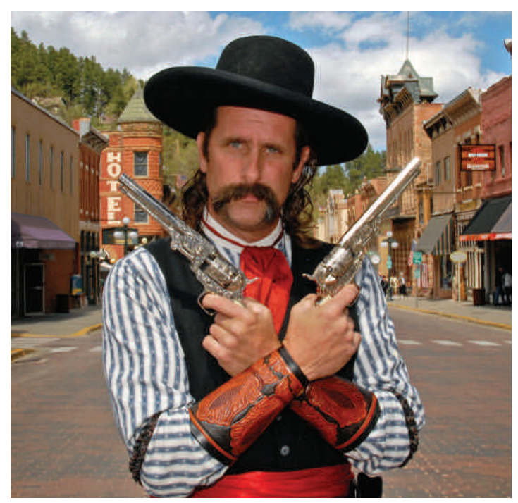
See cowboys and Boot Hill in Deadwood, South Dakota