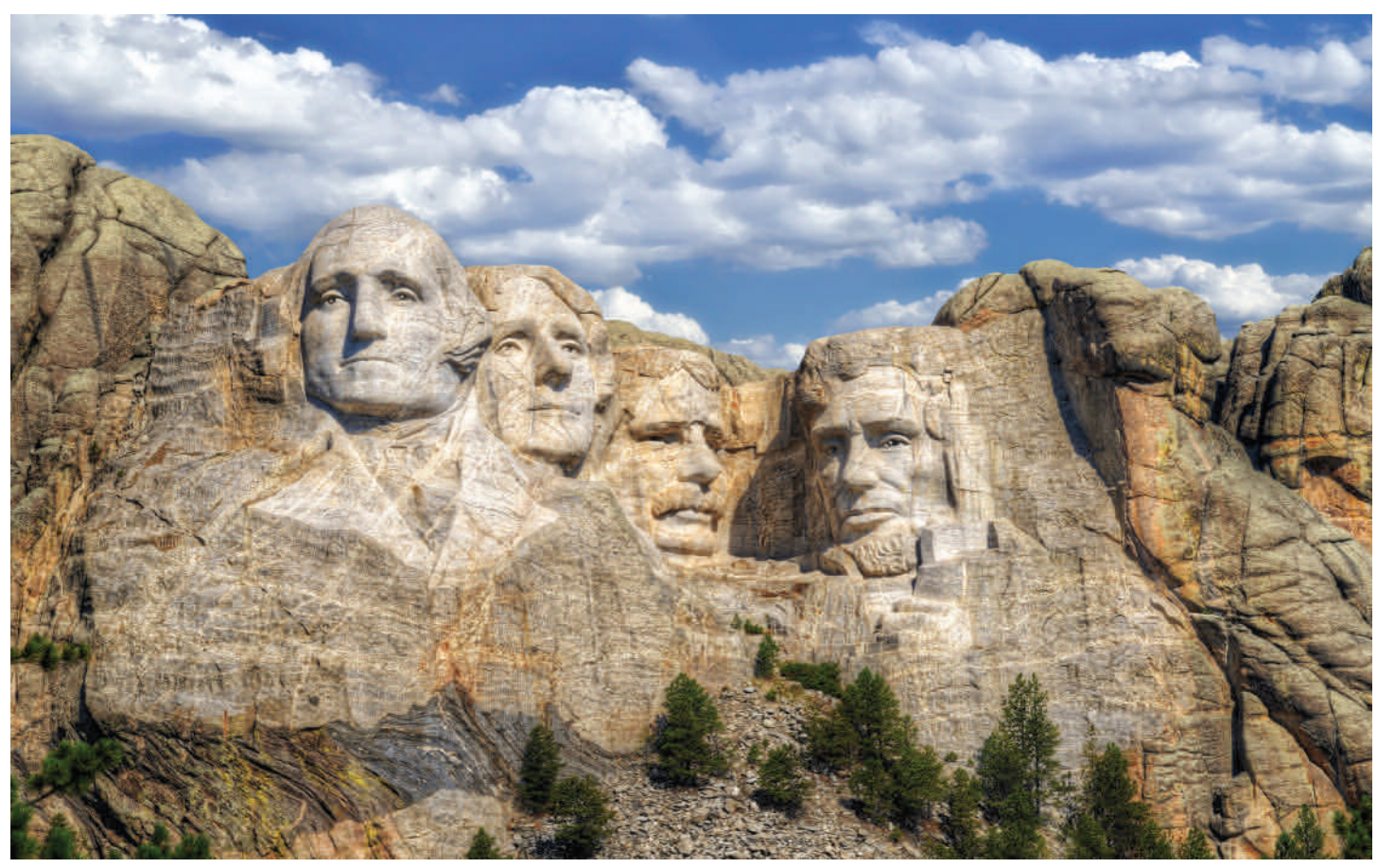
Four remarkable Presidents look at us from their perch on Mt. Rushmore